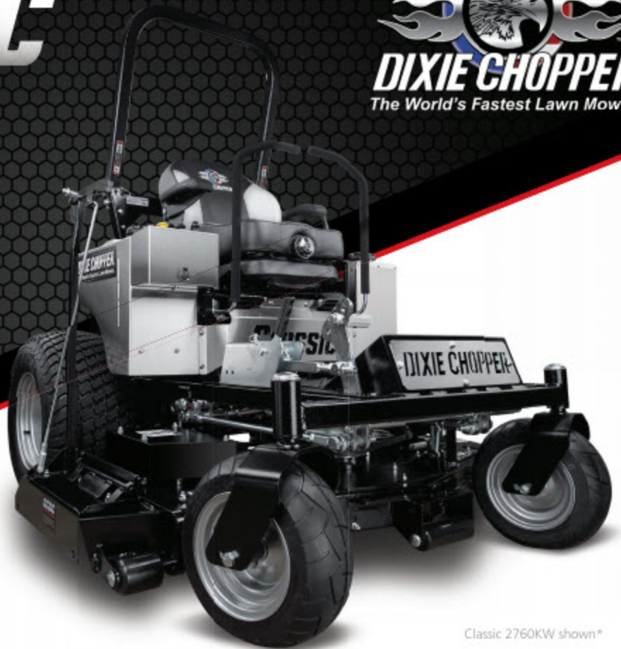
Classic 2760KW shown*