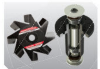
Spindle Package – Maintenance-free spindles and cooling fans come standard.