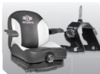
High Performance Package – Comes standard on select models.