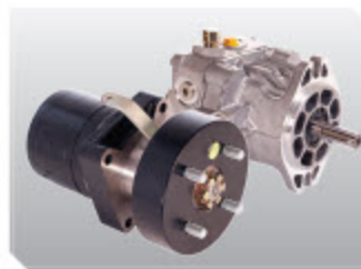
Pumps & Wheel Motors – Stronger transmissions for extended system life.