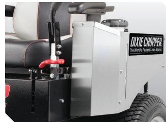
Stainless Steel – Protects fuel tank from sun and impact damage