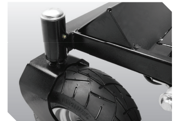
Commercial Forks – Greaseable and lifetime warranty against breakage