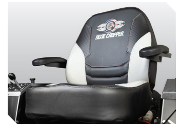
Comfort Ride – Plush cushioned seat with armrests for extra comfort