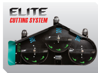
42", 48", and 54" Elite Cutting System – Formed and welded 10 ga deck shell