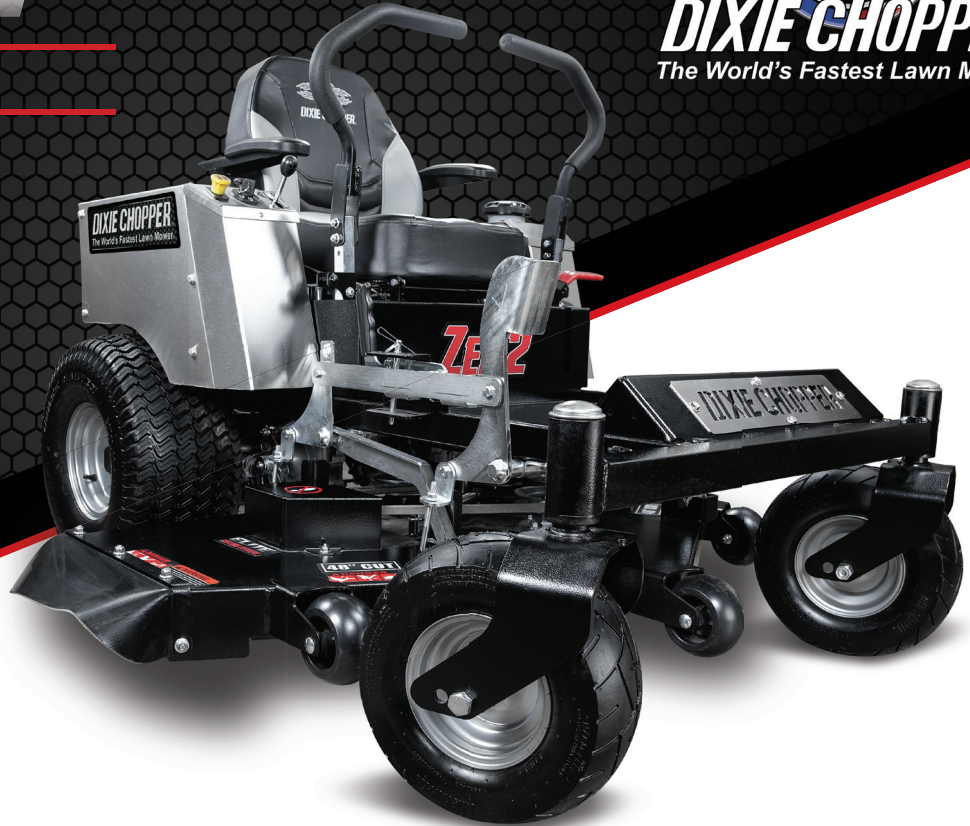
Zee 2 - 2348KW model shown*