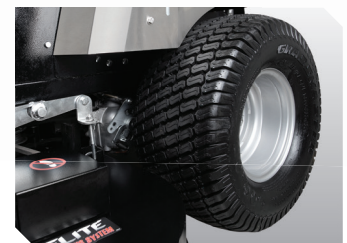
Large Rear Tires – More traction, more speed, and better stability