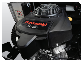
Proven Power – 24hp Kawasaki engine for more performance and reliability