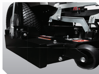
Discharge Chute – Take full control of clippings with the OCDC