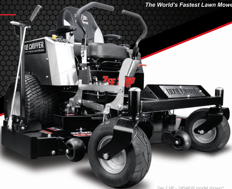
Zee 2 HP - 2454KW model shown*