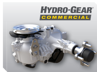
Hydro-Gear® ZT-3100 – Commercial grade drivetrain with serviceable filters