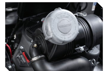
Turbinator® Pre-Cleaner – Exclusive feature removes debris for cleaner air.