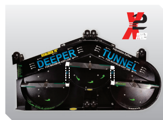
X2 "Wind Tunnel" Deck – Increases airflow and reduces build-up inside deck.