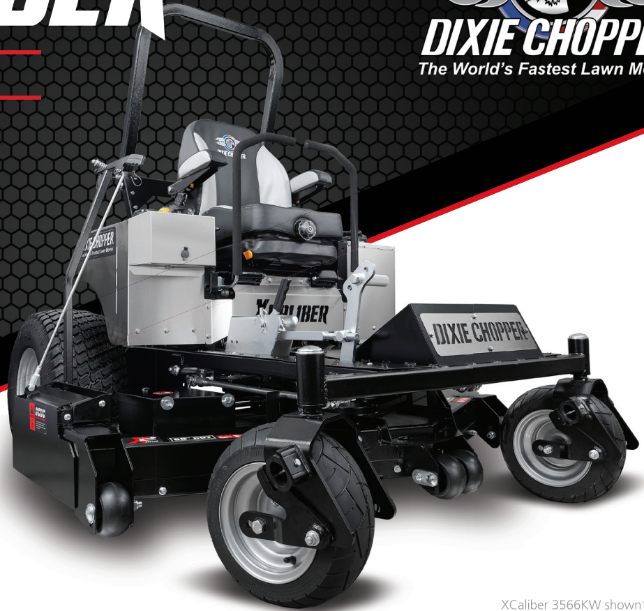
XCaliber 3566KW shown*