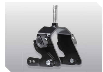
Springer Forks – Absorb bumps for added comfort and increased productivity.