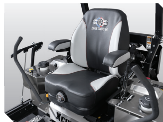
Total Comfort – Suspension seat with recline, lumbar, and padded armrests.