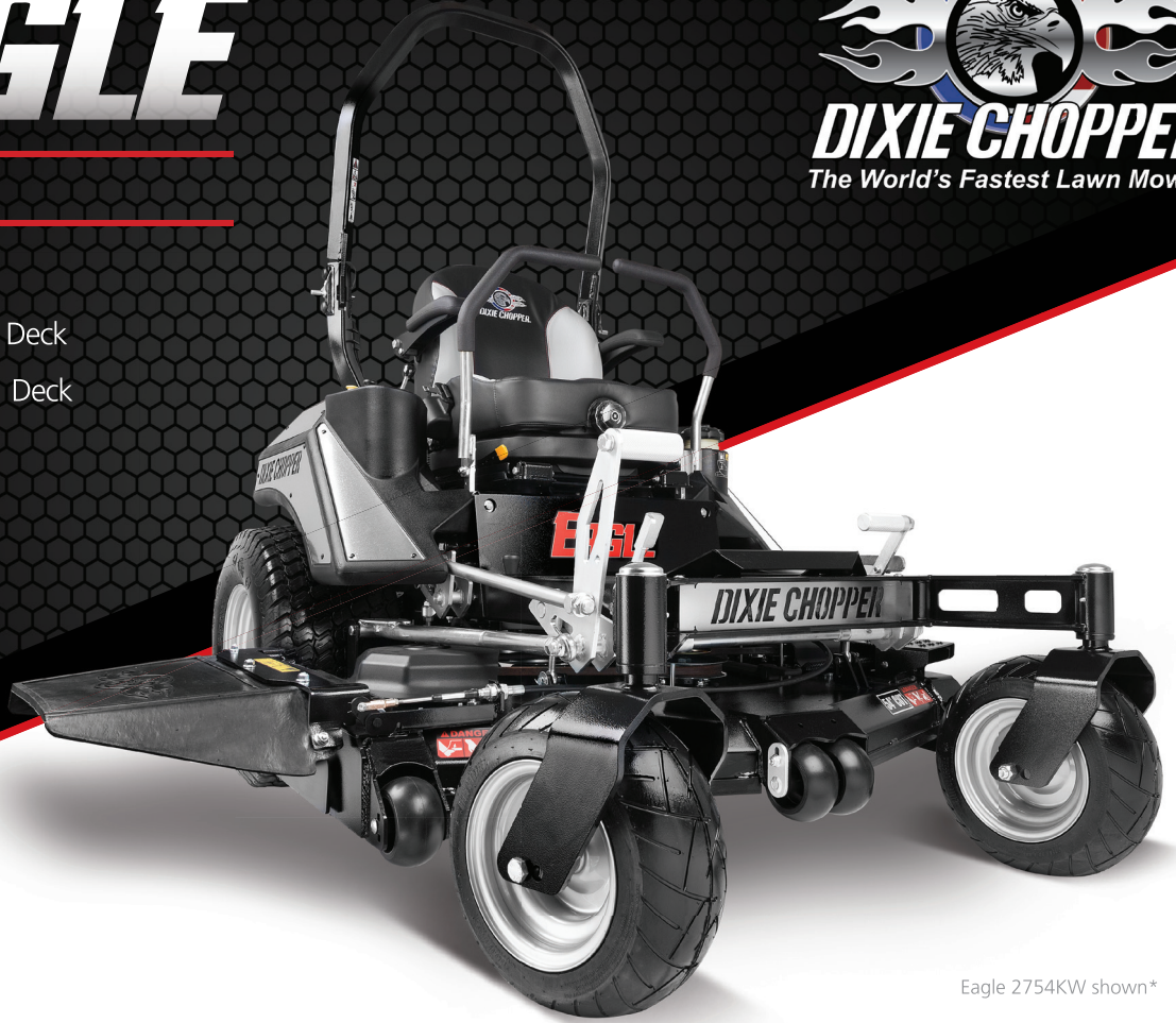
Eagle 2754KW shown*