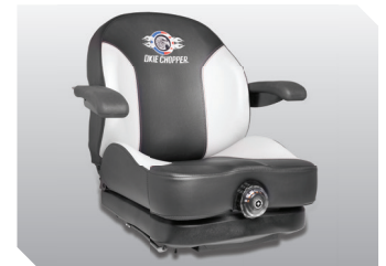
Ultimate Comfort – ISO mounted suspension seat for all-day comfort