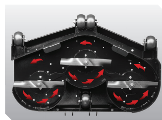
54" and 60" Decks – Deep 7 gauge shell to tackle deep grass with ease