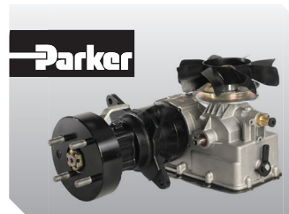
Parker® HTG – Smooth steering and 1,000 hour oil change intervals