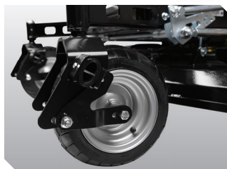
Springer Forks – Help absorb rough terrain and provide smoother ride