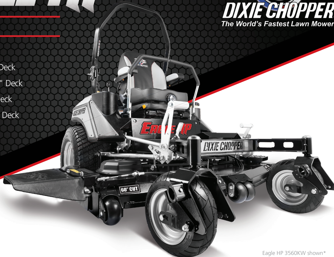
Eagle HP 3560KW shown*