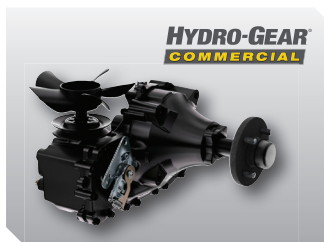
2-Speed Transaxle – Drive speeds up to 18mph for increased productivity