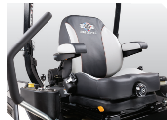
Suspension Seat – High back, padded armrests, and isolated platform