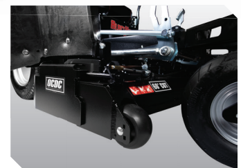
OCDC – Foot-operated to keep your hands on the steering levers