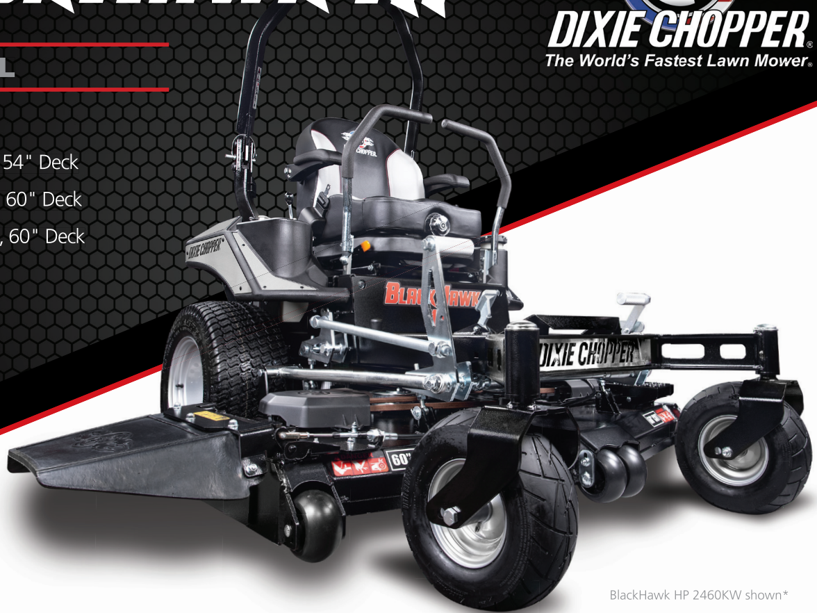
BlackHawk HP 2460KW shown*