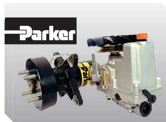
Parker® HTJ – Smooth steering and speeds up to 10 miles per hour