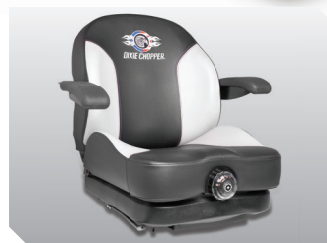
Suspension Seat – Full suspension for ultimate comfort all day long.